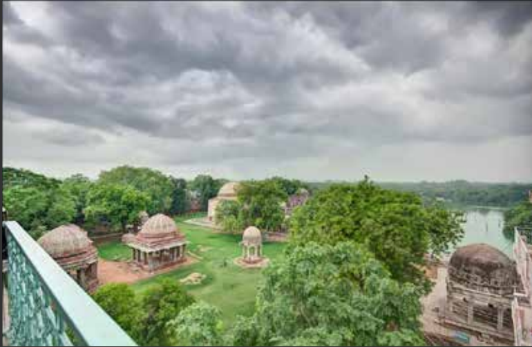
HAUZ KHAS VILLAGE