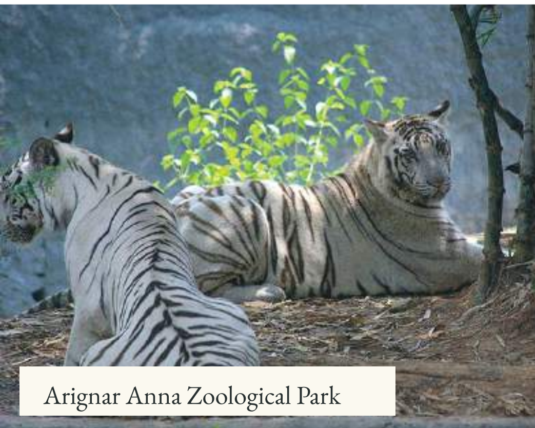
Arignar Anna Zoological Park