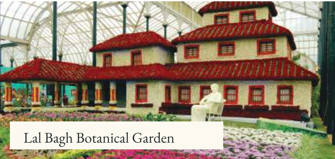
Lal Bagh Botanical Garden