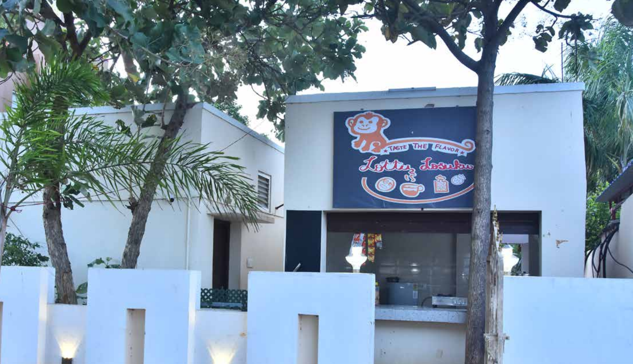
LOTTU LOSUKU TEA STALL