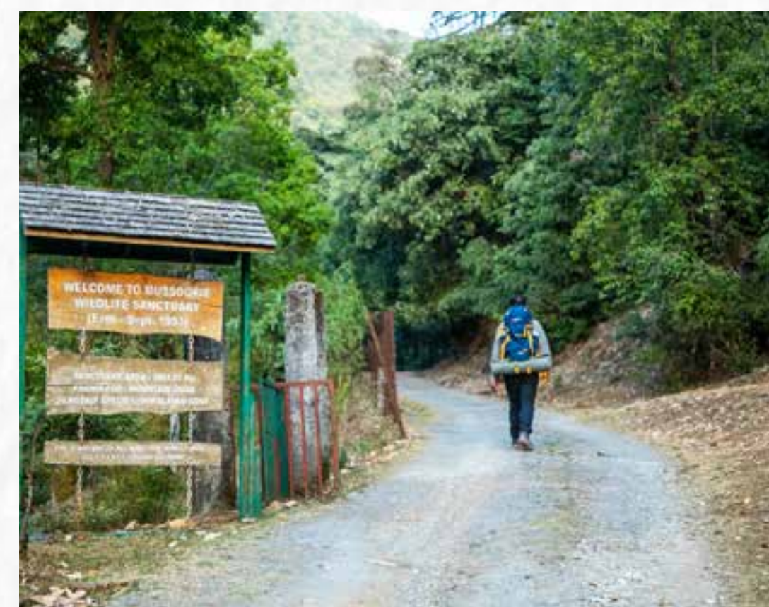
BENOG WILDLIFE SANCTUARY