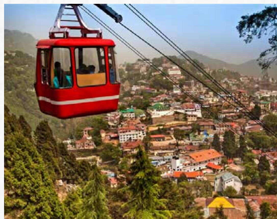
GUN HILL ROPEWAY